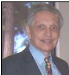
From the Pastor