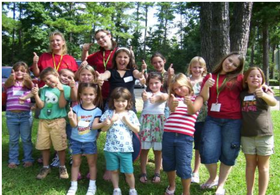
First Day of Vacation Bible School

Maybe the lawyer in the Gospel lesson for this week (Luke 10.25-